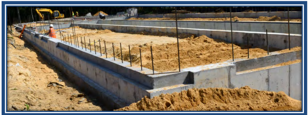
Construction of GAC project

“GAC is a forward-looking technology that will serve as an additional protective barrier against water contaminants and will help ensure that Brick Utilities continues to surpass potential drinking water standards going well into the future.”